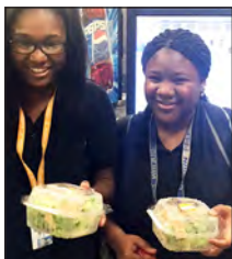
PEHS students choosing the Grab N' Go salads.

To improve access to high quality food for students and staff, the Wellness Committee implemented "Grab and Go" salads in the PEHS cafeteria on March 1, 2016. With pre-made salad options, student can quickly pick up fresh fruits and vegetables, making the healthy choice also the easy choice. The program started serving 100 salads daily. Due to a positive student response and increase demand, this increased to 160 salads daily in the fall of 2016.