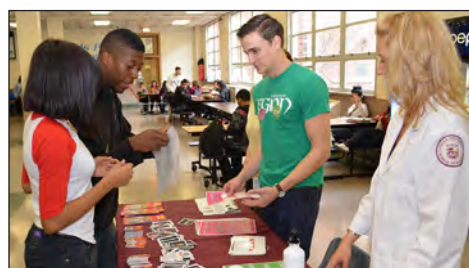
Health information for students in the PEHS cafeteria.

On National Food Day , dietetic interns had a booth in the school cafeteria where they discussed eating fresh, healthy foods in place of packaged and processed foods.