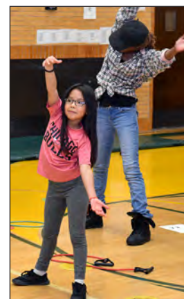
Student and parent yoga class at Emerson elementary in District 89.