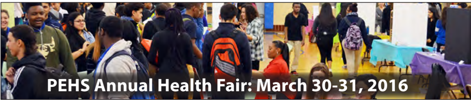
PEHS Annual Health Fair: March 30-31, 2016

All Proviso East students were included in another successful annual health fair. Over 30 topics were presented by Loyola students from various health care disciplines and by local community partners. In addition, PEHS students were selected by their health teachers to present a health related topic based upon a classroom assignment.