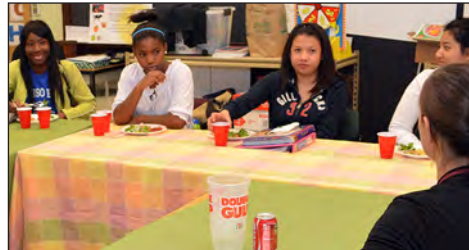
Students at Lunch Bunch learning about sugary drinks.

Lunch Bunch continues to be one of SBHC's most successful and anticipated group education offerings, with a total of 61 Lunch Bunch sessions serving 1,344 PEHS students in 2016.